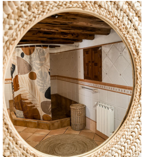
ROOM 5 – Twin or double Suite with small terrasse and pool access, shared bathroom – 1695 € p. P.